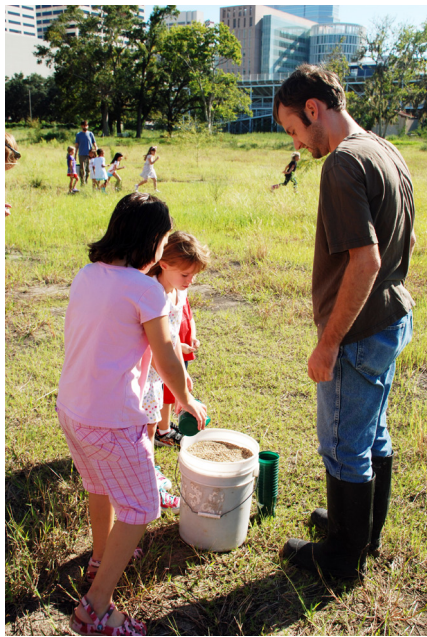
Wildflower planting with West University Daisy Troopers

If you would like to help support the Arboretum's growth or have questions or suggestions, please contact: